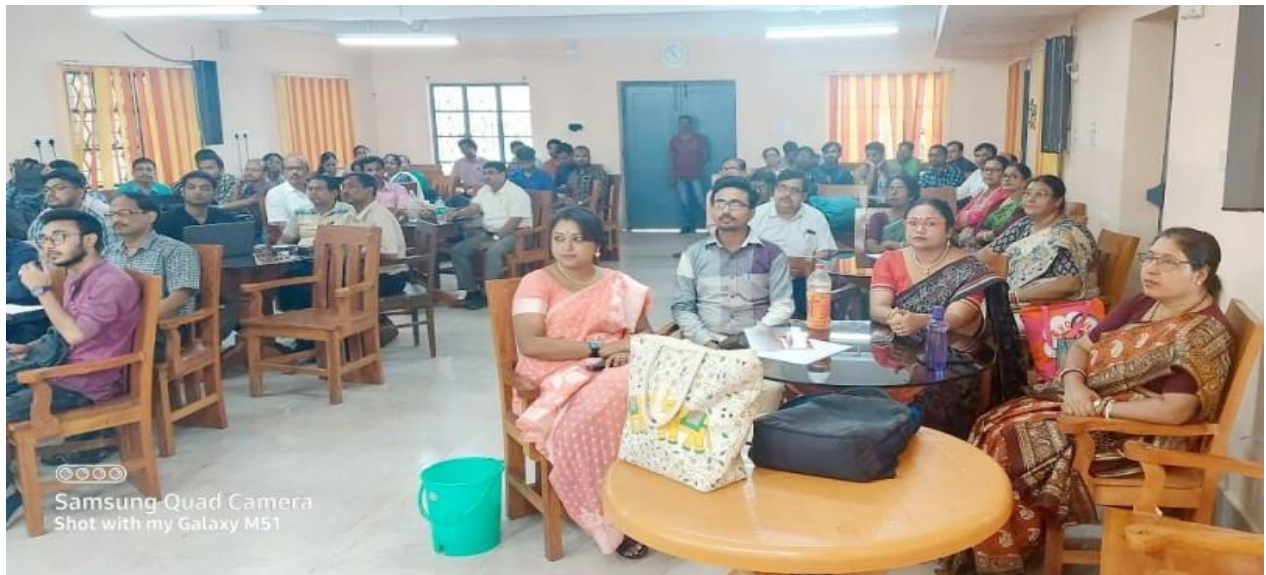
Participants at DIET, Hooghly on 26.07..2024

The SCERT(WB) in collaboration with, DIET Hooghly, DIET Malda and The WTL arranged training program for around 100 faculties and Technical personnel in the DIETs and PTTIs (Government/ Govt. Aided/ Sponsored) in West Bengal.