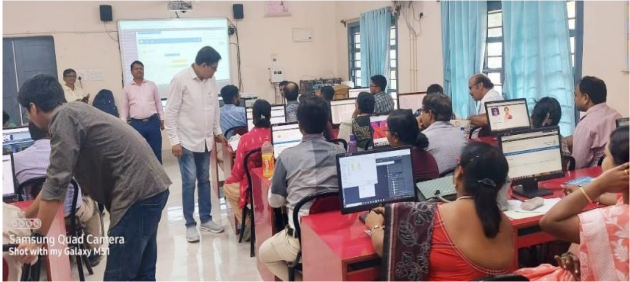
Hands on Training is going on at DIET Hooghly on 27.07.2024