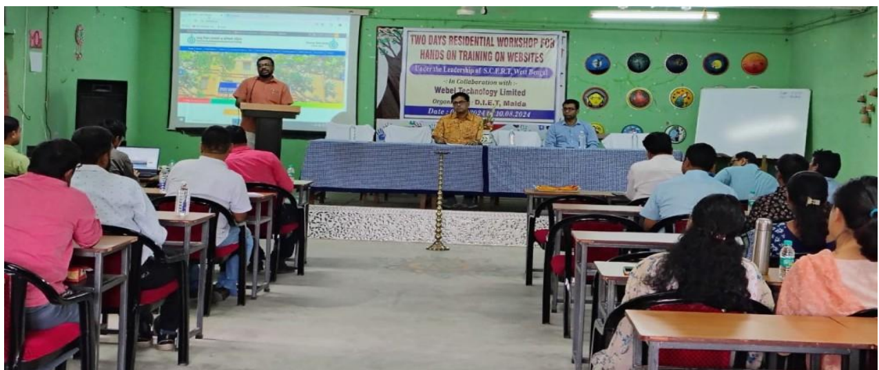
Inaugural session at DIET, Malda on 09.08.2024